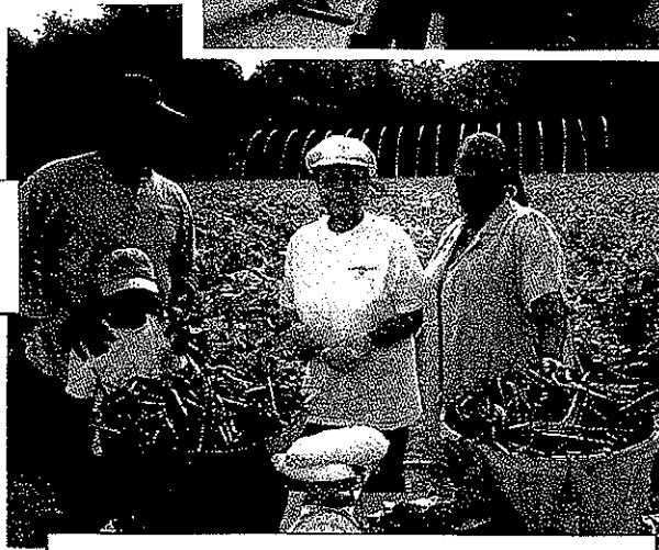
Community Garden Harvested Vegetables