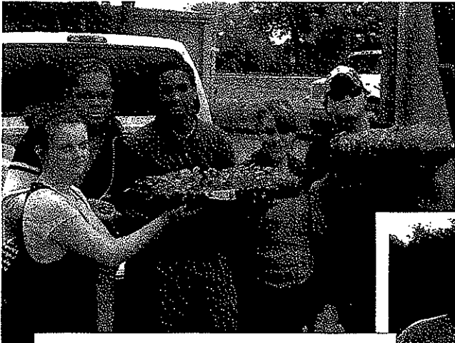
Starter Plants raised by Vo Ag students and used in the High Tunnel and Community Garden